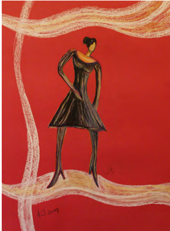
"Dancing with yourself".Pastel on paper. 61x45 cm. 2014