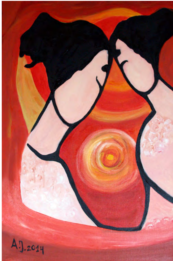
"Time_to_Dance". Oil on canvas. 60x40 cm. 2014