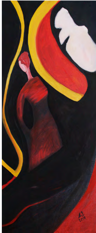
"Looking back". Oil on canvas. 107x45 cm. 2014