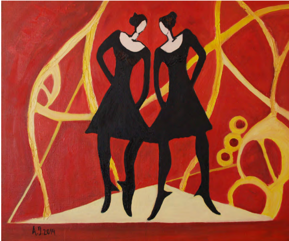
"It is time to dance". Oil on canvas. 65x75 cm. 2014