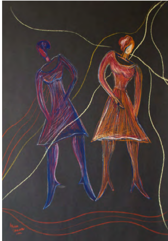
"It is time to dance - dream on". Pastel on paper. 61x45 cm. 2014