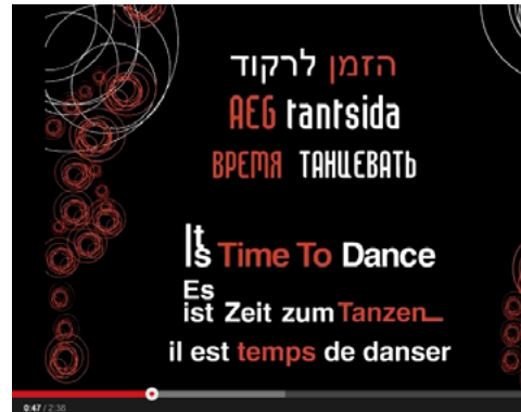
Video "Time_to_dance" Duration: 2.38 min. 2007 https://www.youtube.com/watch?v=eH82apY_BT8