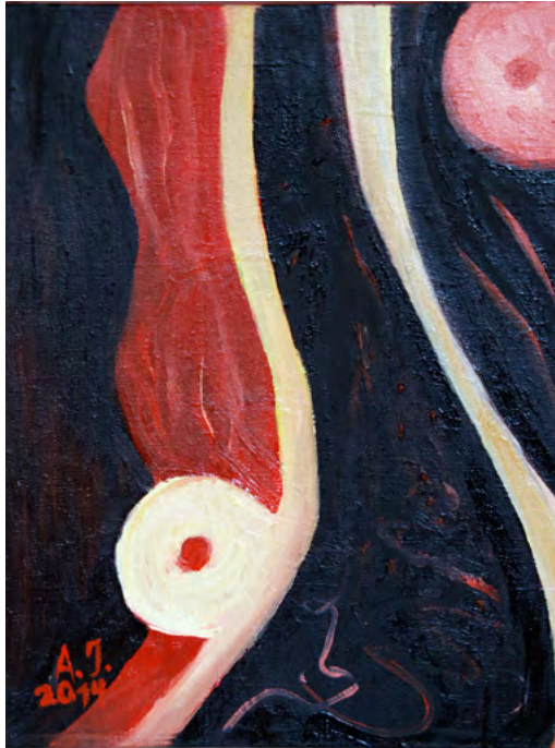
"When a woman loves a man". Oil on canvas. 37x28 cm. 2014