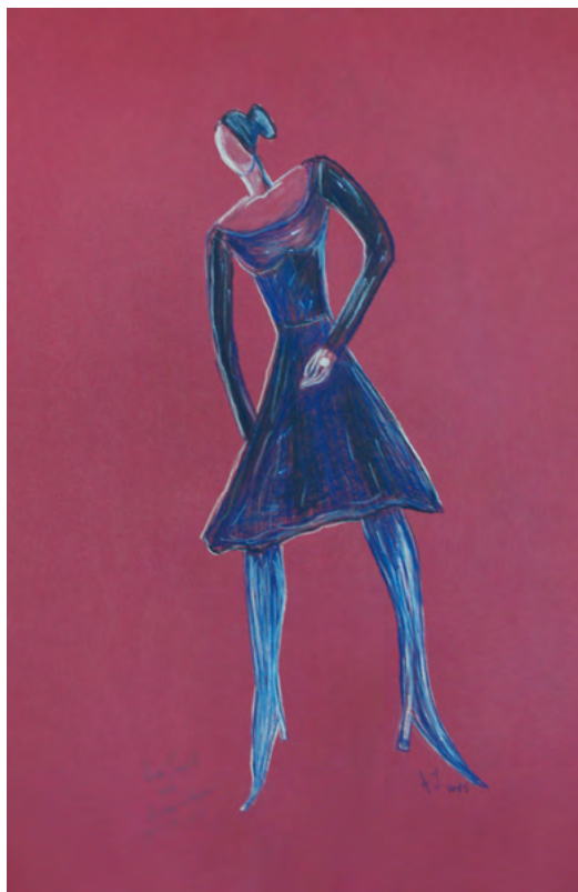
"Dream on". Pastel on paper. 62x39 cm. 2014