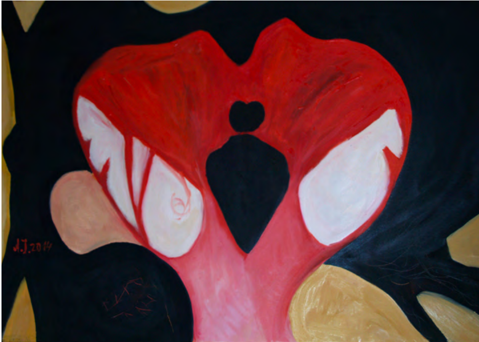
"Twins". Oil on canvas. 50x70 cm. 2014